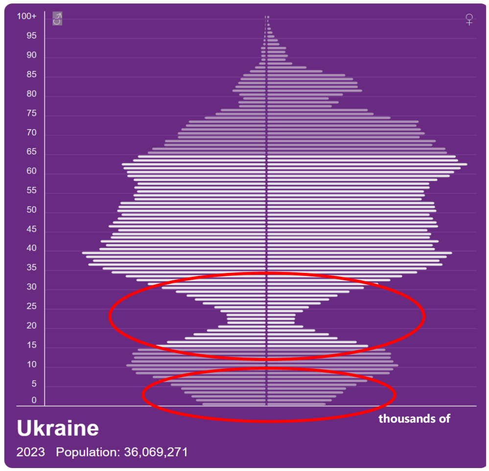
Fig. 2. Sex and age of the Ukraine population (early 2023)

few people of working age, but also a very small number of underage children, which means that future generations will be much smaller in number than older people.